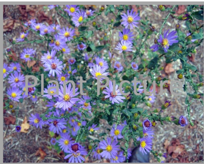
Symphotrichum patens var. patens