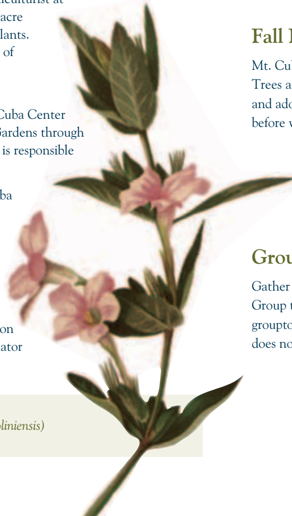
Carolina petunia ( Ruellia caroliniensis )

Gather your group for a special two-hour experience in the gardens. Group tours can be scheduled for groups of 10 or more. Email us at grouptours@mtcubacenter.org or call 302.239.4244. Our website does not accommodate group tour registration.