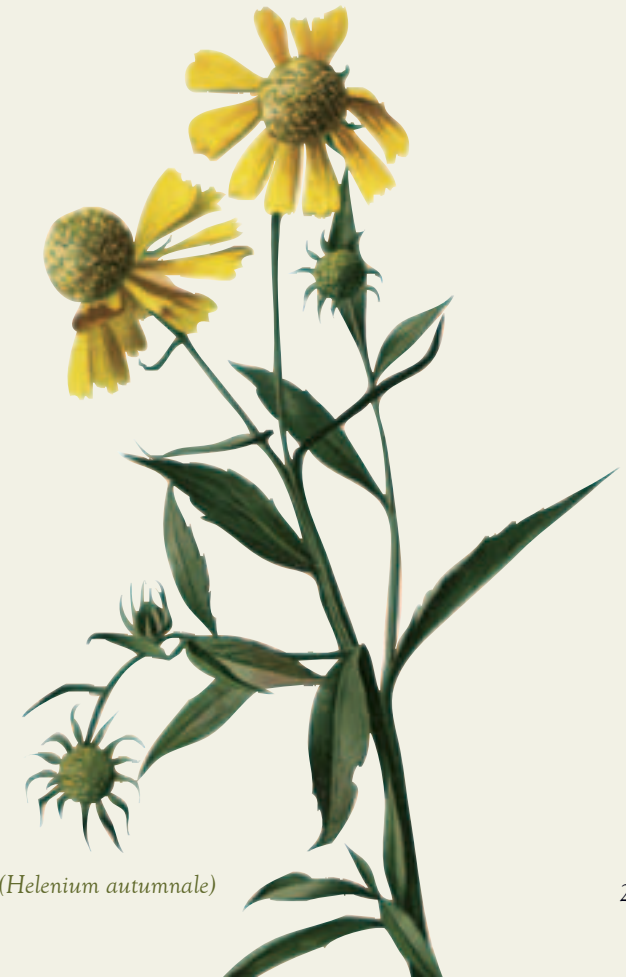
Common sneezeweed ( Helenium autumnale )