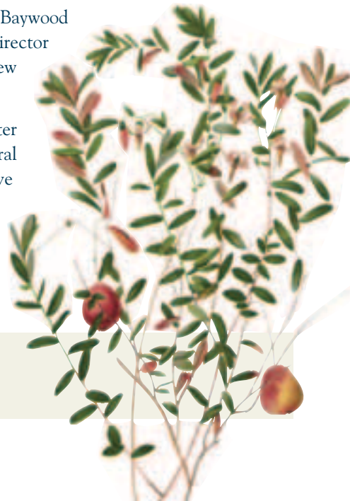
Cranberry ( Vaccinium macrocarpon )