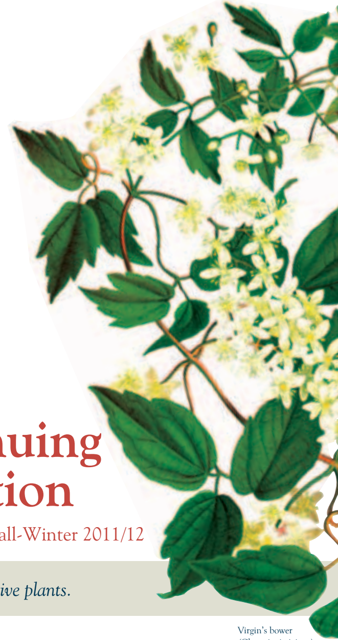
Virgin's bower ( Clematis virginiana )