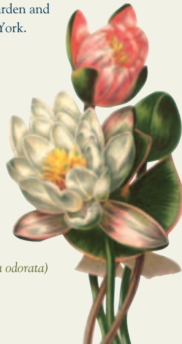
American white waterlily ( Nymphaea odorata )